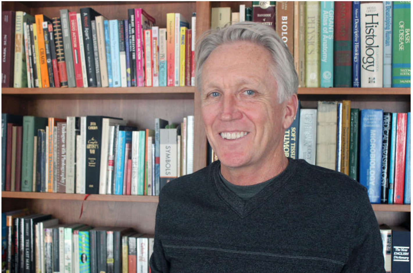
( http://mediad.publicbroadcasting.net/p/vpr/files/styles/x_large/public/201605/greg-vpr-masterson-20160512.jpg )

Tweet (http://twitter.com/intent/tweet?url=http%3A%2F%2Fwww.tinyurl.com%2Fj2la5ll&text=For%20One%20Vermont%20Man%2C%20Sequencing%20His%20Genome%20Solved%20A%20Life%20Of%20Pain)